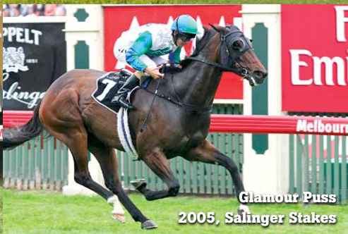
Glamour Puss 2005, Salinger Stakes