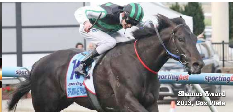
Shamus Award 2013, Cox Plate