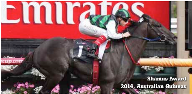
Shamus Award 2014, Australian Guineas