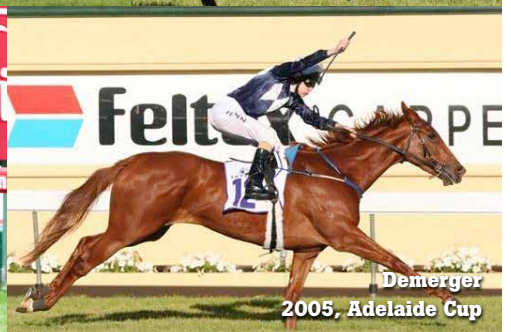
Demerger 2005, Adelaide Cup