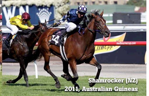
Shamrock (NZ) 2011, Australian Guineas