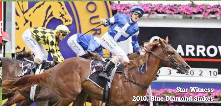
Star Witness 2010, Blue Diamond Stakes