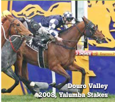
Douro Valley 2008, Yalumba Stakes