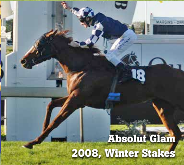
Absolut Glam 2008, Winter Stakes