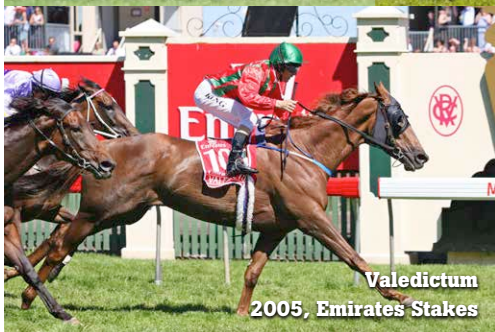
Valedictum 2005, Emirates Stakes