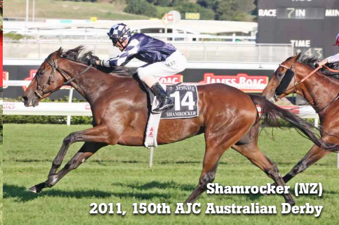
Shamrock (NZ) 2011, 150th AJC Australian Derby