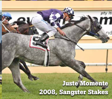
Juste Moment 2008, Sangster Stakes