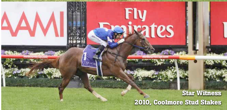
Star Witness 2010, Coolmore Stud Stakes