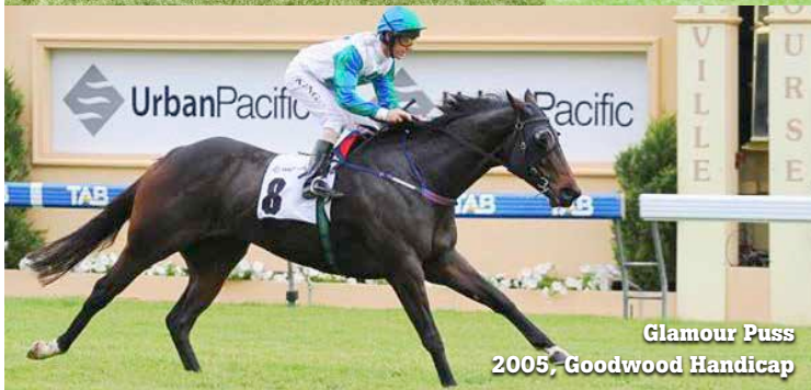
Glamour Puss 2005, Goodwood Handicap