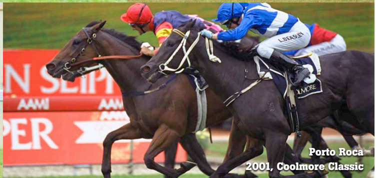
Porto Roca 2001, Coolmore Classic