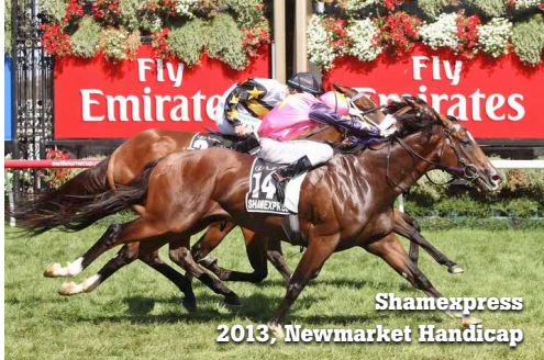
Shamexpress 2013, Newmarket Handicap